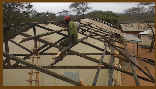
~◇ Termite Turmoil ◇~

The students and staff of Maanzoni PS will literally have a new roof over their heads thanks to Solley ES in Glen Burnie, MD.