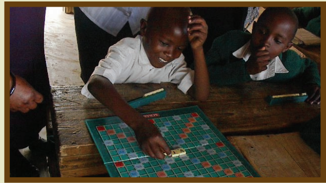
~◇ Mind Games ◇~

Students from Union ES in Clinton, NC provided a Sporting Goods Package for Nunga PS which included Scrabble and other board games.