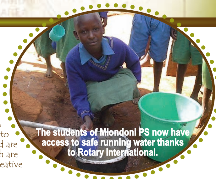
The students of Miondoni PS now have access to safe running water thanks to Rotary International.