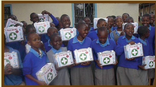
~◇ Special Projects ◇~

Sporting Equipment has been a popular item with students fundraising over the years. To date nearly $10,000 has been raised for balls, nets and track and field equipment. However many of our schools over this past year made requests for games to exercise the brain, particularly on a rainy day.